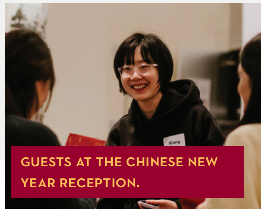
GUESTS AT THE CHINESE NEW YEAR RECEPTION.